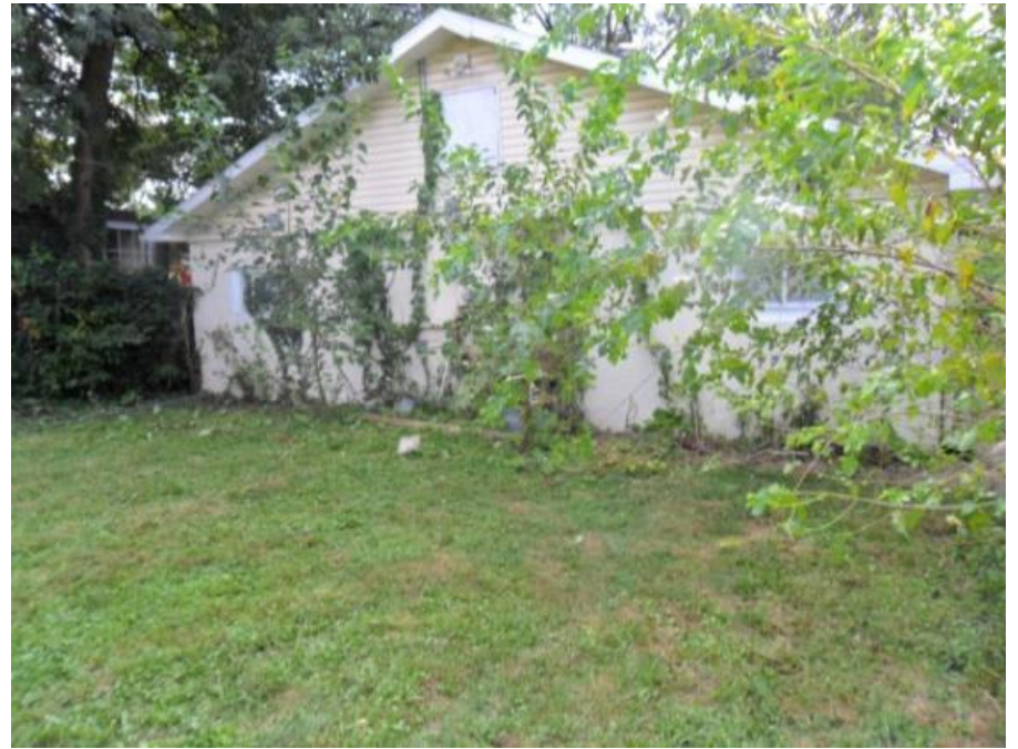
Right side of backyard looking towards the house