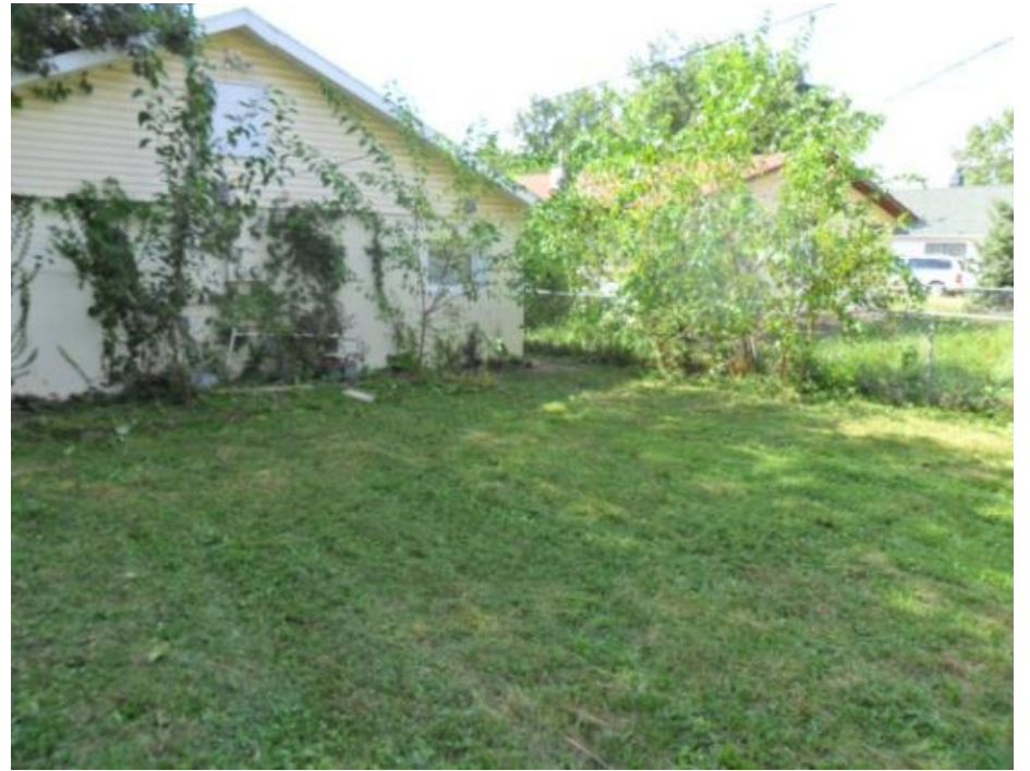
Left side of backyard looking towards the house