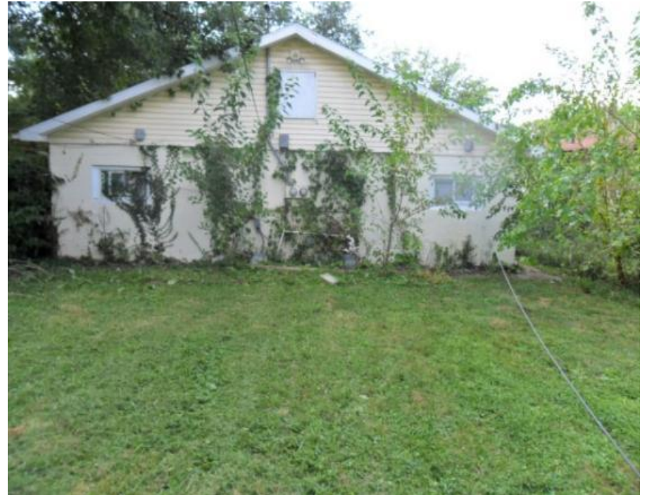
Middle of backyard looking towards the house